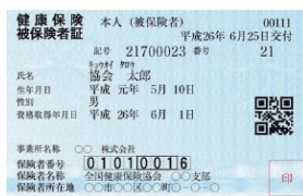
Example of an Insurance Card

If you use your health insurance card, 70% of your medical costs will be covered. You only have to pay 30% of your total medical bill.